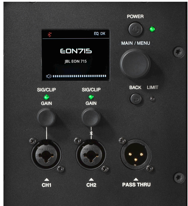
REAR PANEL CONNECTIONS

The JBL EON715 15-inch loudspeaker, part of JBL's new EON700 Series of powered PAs, brings advanced DSP and control to portable systems for live sound and installed applications, with class-leading volume and clarity and comprehensive features that make setup and operation a breeze.