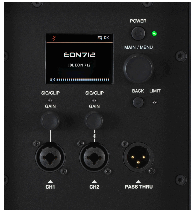
REAR PANEL CONNECTIONS

The JBL EON712 12-inch loudspeaker, part of JBL's new EON700 Series of powered PAs, brings advanced DSP and control to portable systems for live sound and installed applications, with class-leading volume and clarity and comprehensive features that make setup and operation a breeze.